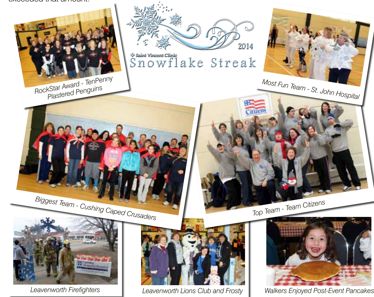
RockStar Award - TenPenny Plastered Penguins

Each team was encouraged to raise at least $750, the average cost for a full year of medical care for one patient at Saint Vincent Clinic. Demonstrating BOTH compassion and competitiveness, many teams well exceeded that amount.