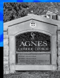
St. Agnes Catholic Parish Caritas Award