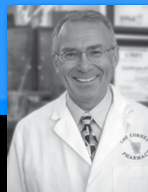
The Corner Pharmacy Businesses of the Year